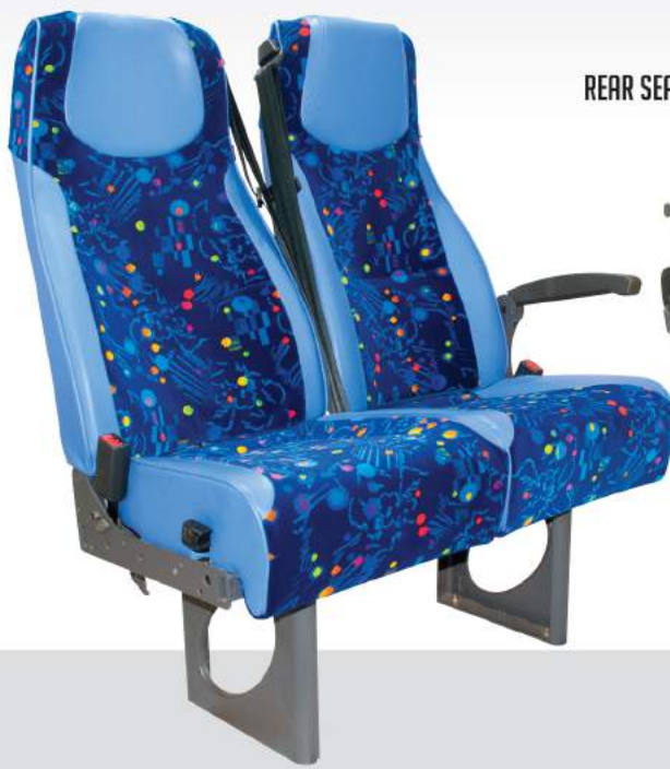
REAR SEAT VIEW